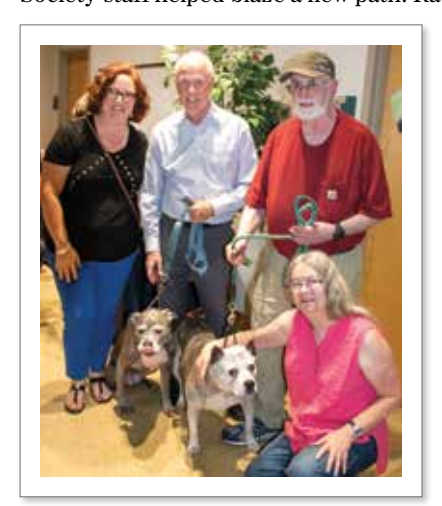
M0500 alumni and their best friends

Giving as many of these dogs as possible a second chance also was part of the plan. In the past, nearly all dogs rescued from fighting operations were viewed as unadoptable, but Humane Society staff helped blaze a new path. Rather than destroy the