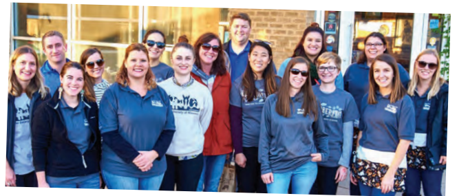
This energetic group of animal welfare supporters is pictured here preparing for one of our annual Barktoberfest gatherings.

St. Louis-area professionals in the 21-35 age group have been organizing the Barktoberfest fundraiser since its 2014 founding. They also host "friend-raising" events to increase awareness among their peers. In addition, this group's very popular beer garden at our annual Bark in the Park has become an HSMO staple.