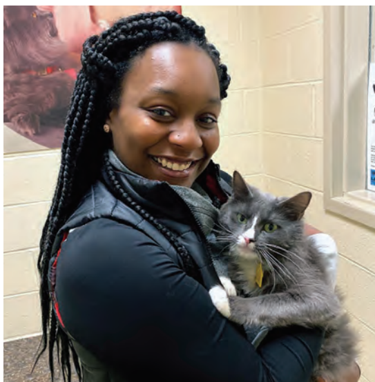
One of our shelter pets recently found a furever home thanks to this young lady.

For more on the past 150 years, visit hsmo.org/150 .