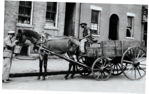
A Humane Society investigator stops to feed a malnourished horse along its route to transport goods in the late 1800s.

The unwavering core mission to save animals from suffering has remained since our inception. From the first time an agent unhitched an overworked horse in 1870, to the more than