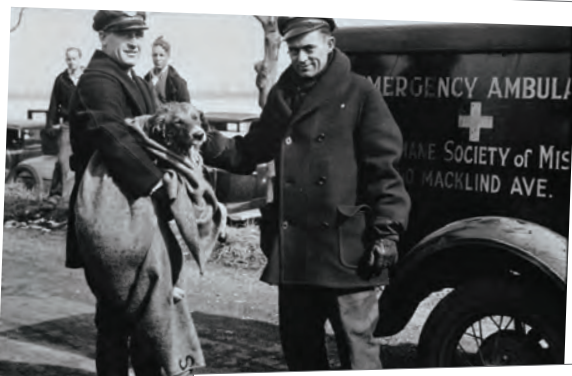
Rescue staff doing what they can to protect the welfare of animals, then and now.

Today the vibrant, compassionate organization that is the Humane Society of Missouri is one of the largest and most respected animal welfare organizations in the nation. It has long been acknowledged by other organizations as one of the best, called to help when large rescues or