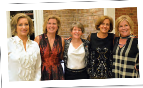
Several WLC members enjoying one of several events hosted by the council annually.